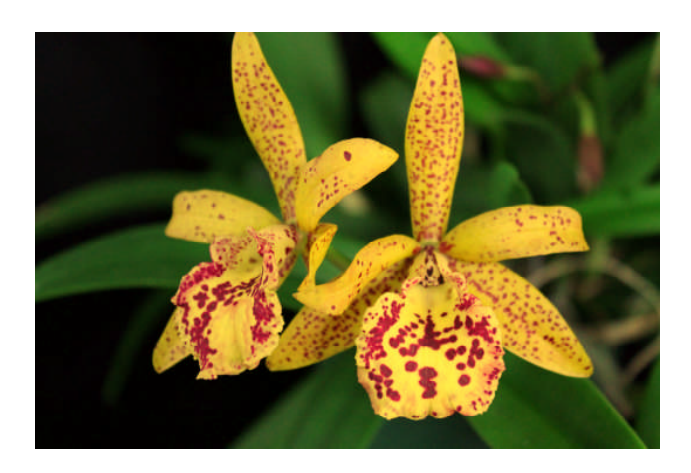
Blc. Rustic Spots 'H & R'