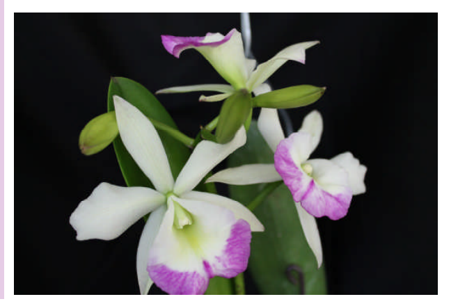
Blc. Hawaii Stars 'Paradise'