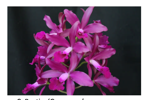
C. Bactia 'Grapewax'