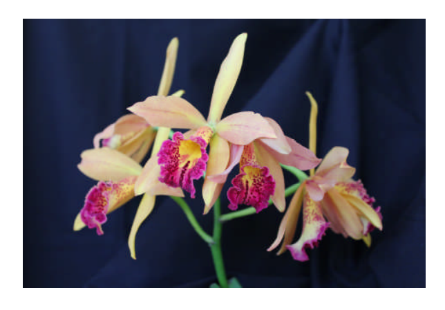
Blc Copper Queen